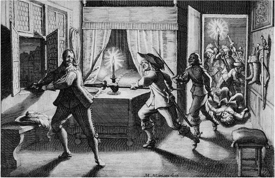
Fig. 1 The assassination of Albrecht of Valdštejn in Cheb (Eger). Engraving by Matthäus Merian, 1639 (SK).