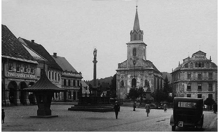
Plate 1: Nová Paka. Postcard. Main square with plague column and church of St. Nicholas (mentioned in 'Poledne').

studio was run on a strictly mercantile basis, churning out standard items of religious art, such as icons and gilded statuettes, but also, mainly to order, secular works such as landscapes, portraits, still-lives and genre paintings. Many years later, Opolský reminisces sardonically: