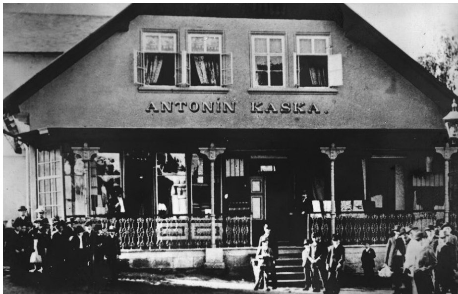
Plate 2: Jan Opolský's birthplace in Nová Paka

Při malbě nešlo o individuální vlohy a umělecký vývoj, ale časem se u malířů vyvinula zručnost mnohem podobná dovednosti středověkých řemeslníků. 10