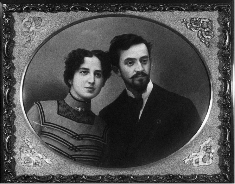
Plate 3: Self-portrait with spouse by Jan Opolský. Photograph of painting (oil on canvas). Impishly, Opolský made himself look half a head taller than his wife although, in reality, it was the other way round.

But it was less the stultifying grind of army routine or the physical strain of military drill that distressed Opolský than the coarse atmosphere: